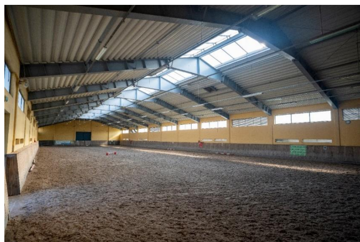
Training Arena 60 m x 20 m